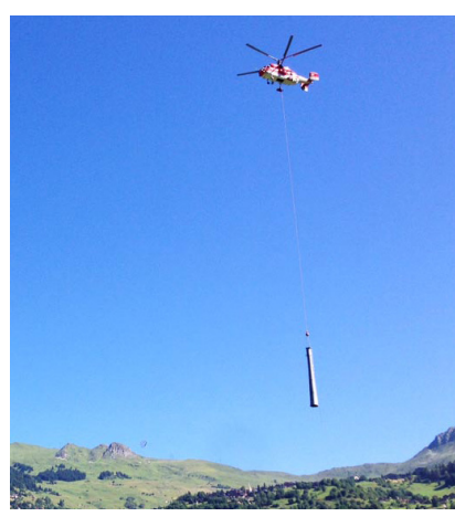
A section of the pylon arrives

The deployment of helicopters for surveillance and maintenance of electrical transmission grids provides multiple advantages, including the ability to visually inspect approximately 300 km. of power lines daily, a quick-reaction capability in detecting and evaluating failure or problems, and the ability to reach difficult or inaccessible areas - all while minimizing the environmental impact.